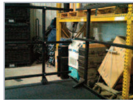
The StageTek deck with rail (on left) and Versalite with rail (on right).