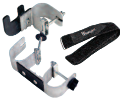
StageTek deck-to-deck connection options