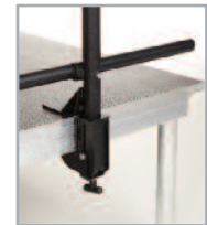
StageTek rail “boots” allow for more room on the deck

Q: Tell me more about the StageTek Velcro straps.