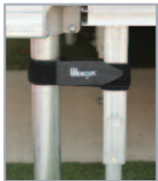
StageTek has square legs; Versalite has round legs