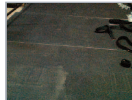
The stage closest to the foreground is the StageTek deck and the back two decks are Versalite